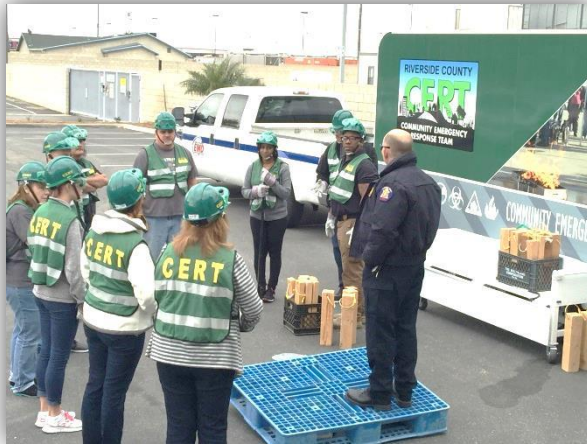
Members of the community learning the basics of cribbing during a CERT class.